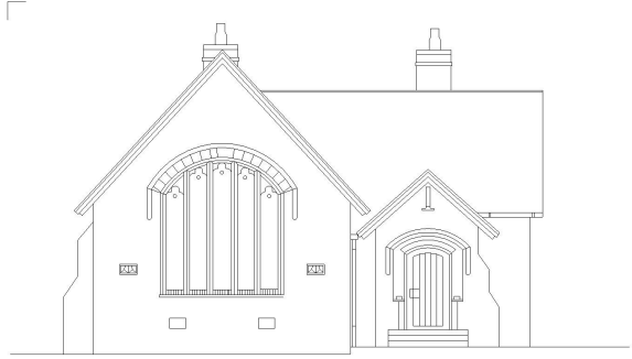
Front elevation (North)