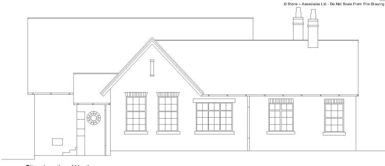
Site elevation (West)