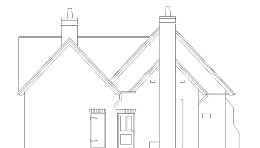
Rear elevation (South)